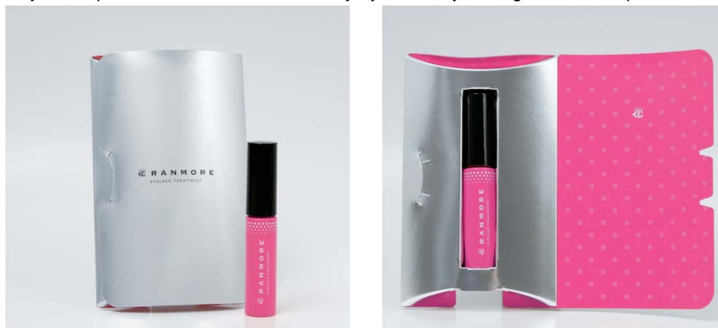
A gentle flocky type for easy application

The safety of the product has been confirmed by eye irritancy testing and human patch testing.