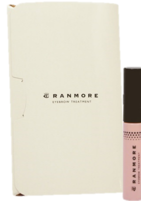
A gentle flocky type for easy application

Use within two months of opening. Let this product dry before applying eyebrow makeup.